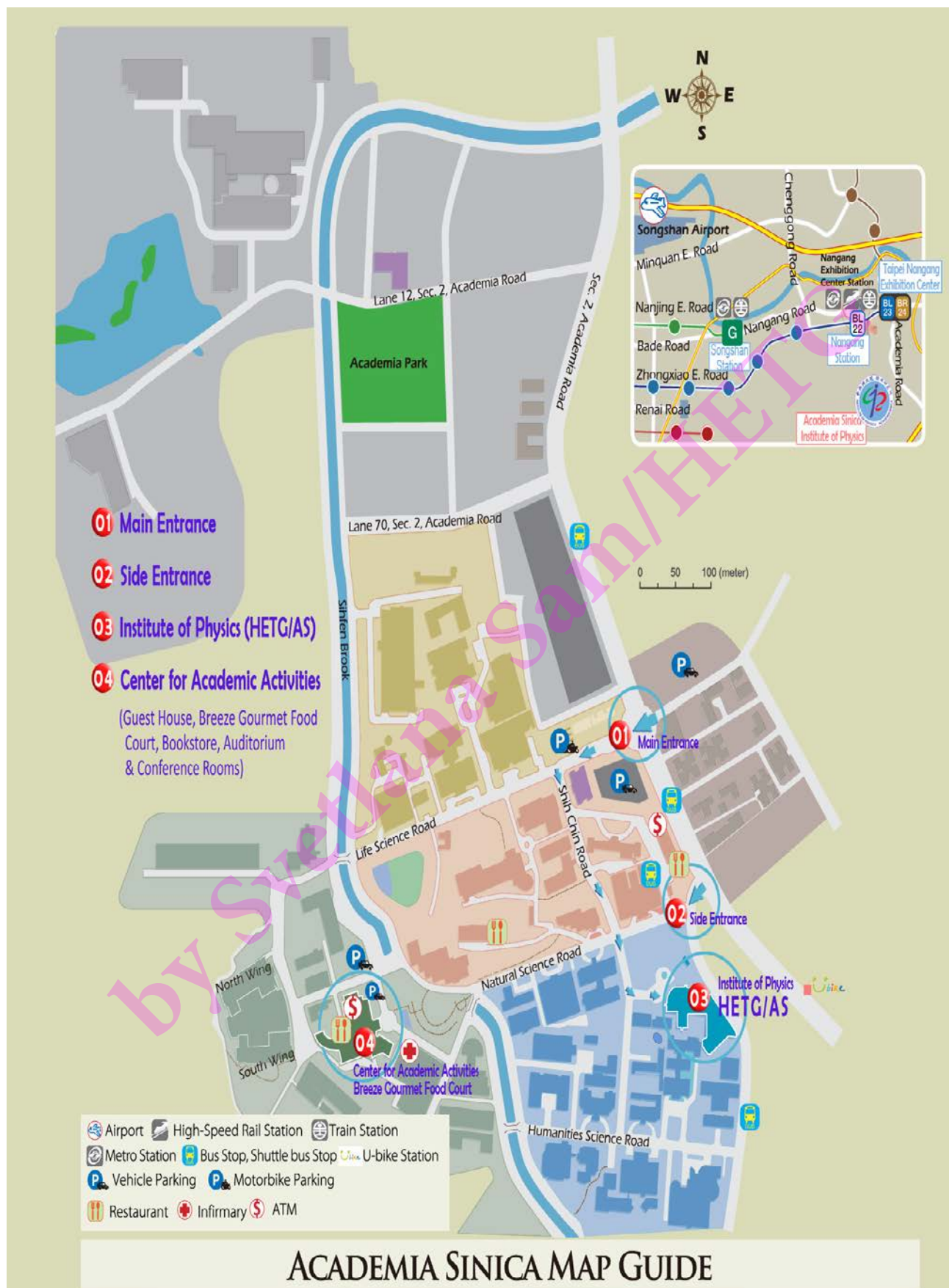
Map 1: Map of High Energy Theory Group and Center for Academic Activities